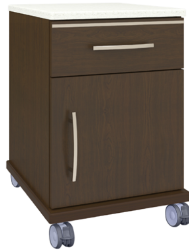
Model: HLBS11HCCTR 21W 19D 30H

Kwalu's Hollywood Mobile Cabinet with Corian® top is designed exclusively for the healthcare market. The Hollywood collection is defined by clean lines and 3/8" brushed aluminum inlays. The cabinet base design is made of thicker panels for stability. Gently rounded corners and tops with a 3/8" edge banding and bullnose profile eliminate sharp edges. Styles included a 1 door, 1 drawer and a three drawer; both with 3" twin wheel front locking Tente casters. Drawer liners and Corian® top are optional. This product is designed for personal items and supplies. It is not intended for clothing storage.